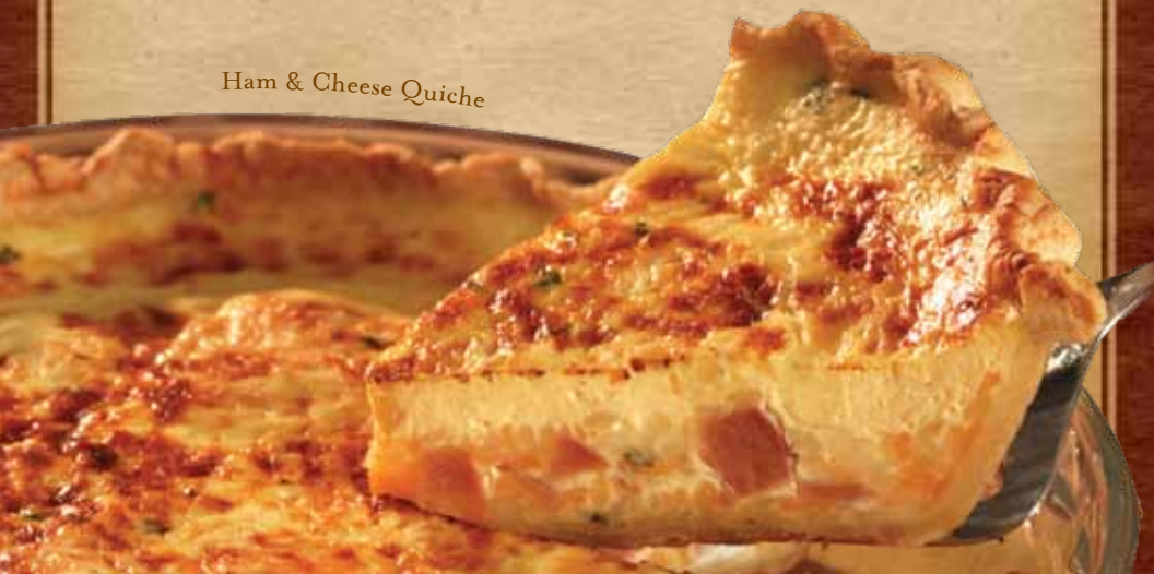
Ham & Cheese Quiche

Small 37 (Serves 10-14) | Large 58 (Serves 15-20)