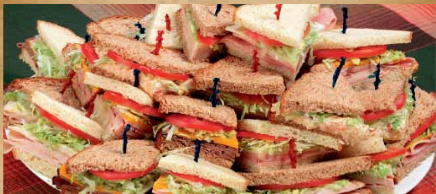
Café Sandwich Tray