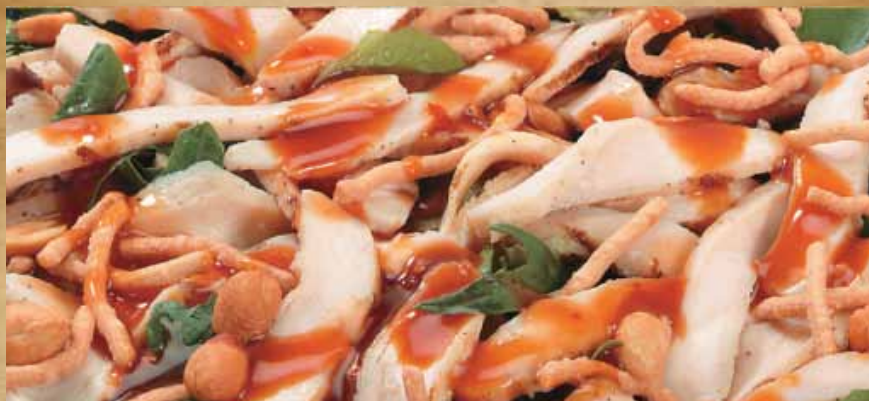
Thai Peanut Chicken Salad