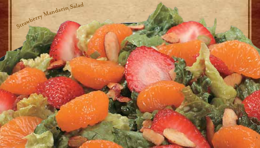
Strawberry Mandarin Salad